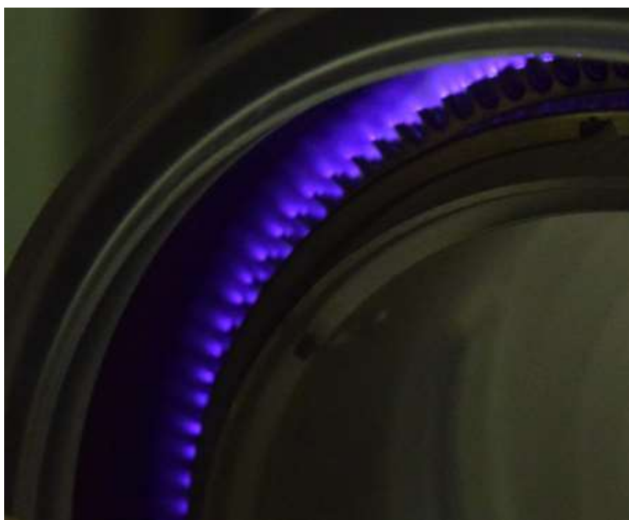
Photo showing the plasma created by the electric pulse between the anodes and cathodes, itself a destructive force.

The FRG system is unique in its ability to purify indoor air in that it delivers a double treatment where the oxidative and destructive capabilities of powerful levels of ROS are significantly aided by the impact of the plasma created within the reactor. This electric field is itself a powerful destructive force whilst also acting to agglomerate the smallest particulate matter.